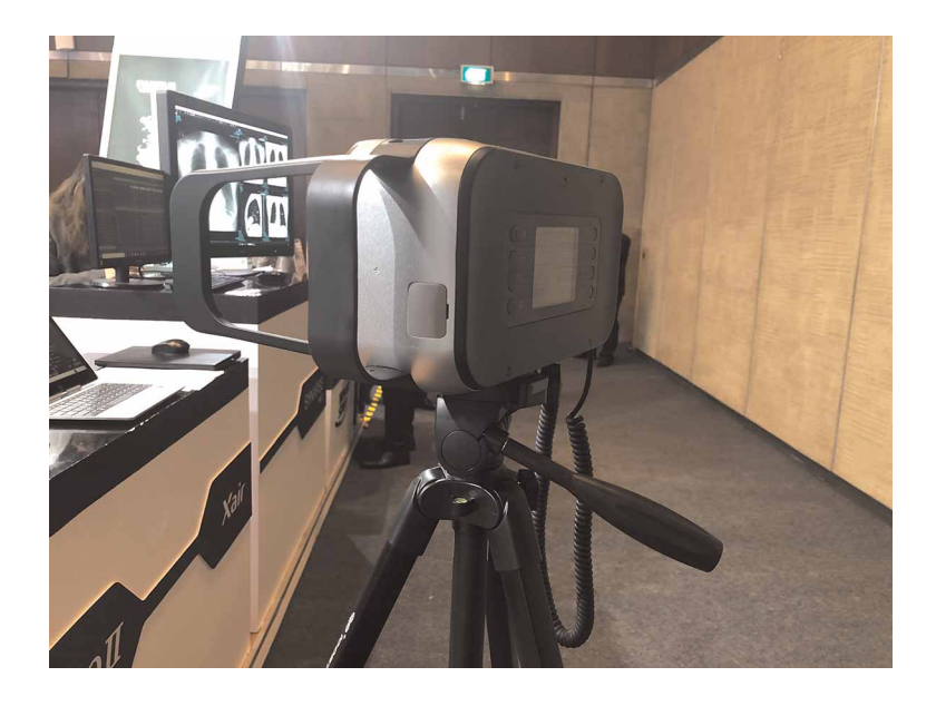
FIGURE 1 An ultra-portable digital X-ray system.

Portable systems are lighter and easier to assemble and disassemble than stationary systems. They can be loaded into cars for transportation to healthcare facilities or temporary clinics, including those with intermittent power supplies, or installed inside large vans for community-based screening [28]. Ultra-portable systems (figure 1) are the newest hardware development. They are small enough to fit in a backpack, weigh <20 kg and are fully battery operated, making them ideal for use in hard-to-reach areas lacking a power supply or as part of event-based screening [28]. Portable and ultra-portable systems have similar, or slightly lower, upfront costs compared with stationary equipment, but each increasing level of portability is associated with a reduction in throughput: while stationary equipment can process more than 300 CXRs per day, ultra-portable systems can manage fewer than 100 per day [28].